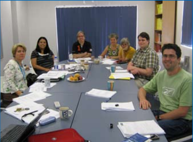
Health policy synthesis workshop

(with the University of the Western Cape, the Western Cape provincial Department of Health and the City of Cape Town health directorate; 2010 - 2012)