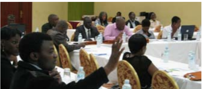
HEPNet workshop in Uganda

This network promotes and realises shared values of equity and social justice in health in East and Southern Africa. Since 1998, the HEU has coordinated EQUINET work around equitable financing of health systems and equitable allocation of health care resources in countries such as Namibia, Tanzania, Zambia, Zimbabwe and more recently Mozambique.