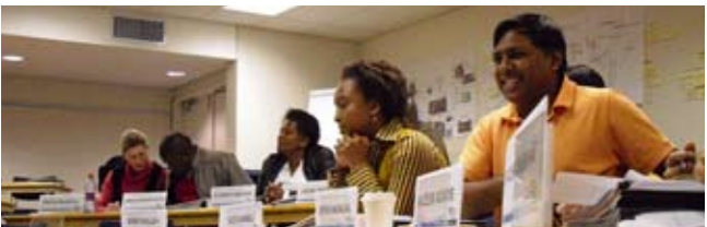
OTFP course in progress

Since 1996, the Masters programmes have trained over 100 people; since 1998, the PhD programme has trained 10 people; since 2007, the Postgraduate Diploma in Health Economics has trained over 50 people and the Postgraduate Diploma in Health Management has trained over 200 people.